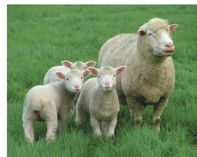
Feeding ewes after lambing correctly ensures that their lambs have plenty of milk and allows the ewes to recover after lambing.